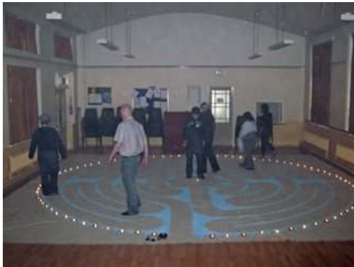
Walking the labyrinth in the Heaviside Hall in Coventry