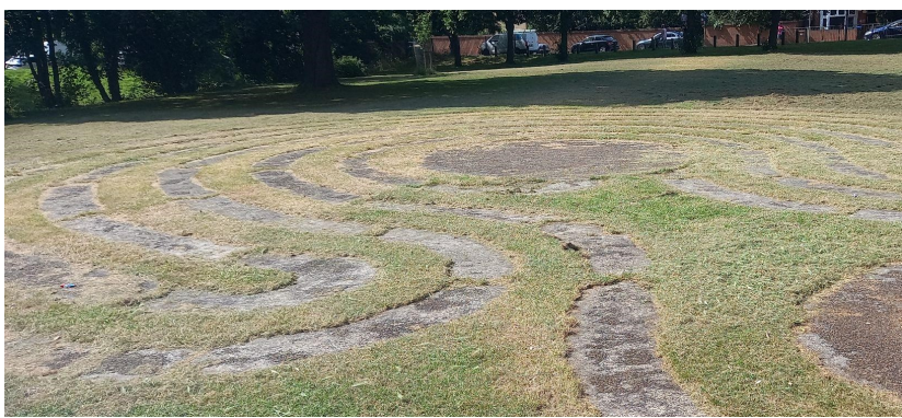
The Dairywalk Labyrinth on the evening of the Summer Solstice 2023

For the Summer Solstice I walked the Dairywalk Labyrinth in Victoria Park. The upper section of the park was once the site of a dairy on the edge of the town known as Dallington Dairy, for the brook which runs down through what was the village of Dallington and joins the upper branch of the Nene just by what is now the park. Jon Small tells me that local schoolchildren were involved in the design of the labyrinth, which is an unusual processional circuit with a large gathering circle leading to an exit alongside the entrance path. It can be walked in both the traditional "in and out" way or the processional way, and for the Solstice I took the opportunity to do both. I also took the leftover petals from the flowers that didn't make it home with the congregation and blessed the ground around the path with them. It would be lovely to do this again for other significant times of year, even in the winter (weather permitting). The space has a lovely energy and is very accessible to all abilities.